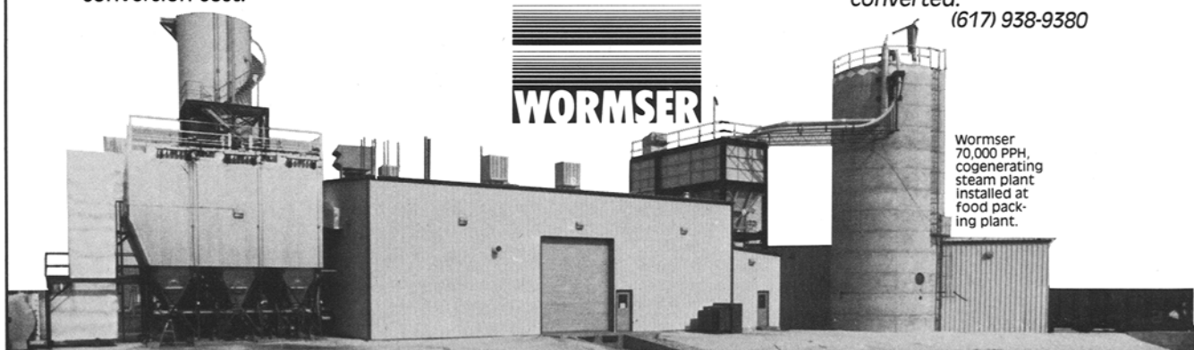
Wormser 70,000 PPH, cogenerating steam plant installed at food packing plant.

WORMSER ENGINEERING, INC. 225 Merrimac St., P.O. Box 4007, Woburn, MA 01888